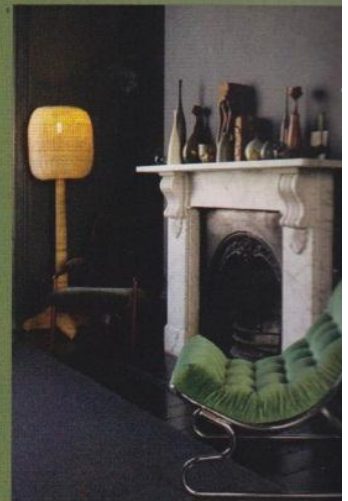
Above: Original Victorian corbel, circa 1860, with a reproduction cast-iron insert, £1800.