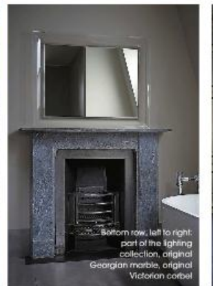
Bottom row, left to right: part of the lighting collection, original Georgian marble, original Victorian corbel