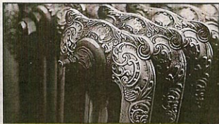
Original Victorian radiators, fully restored with modern fittings, from £200, Renaissance London (020 7251 8844)