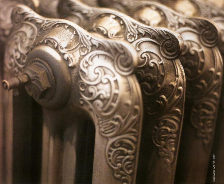
Refinishing 020 7251 8844